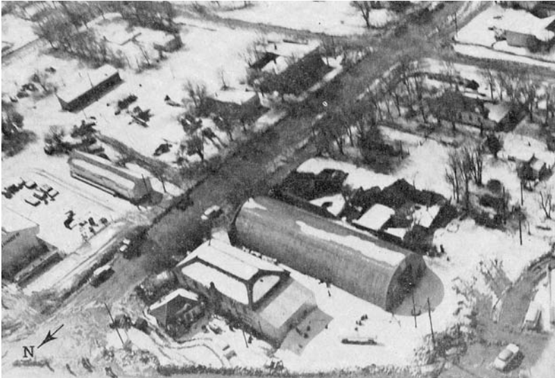
NORTON TELEGRAM, NORTON, KANSAS