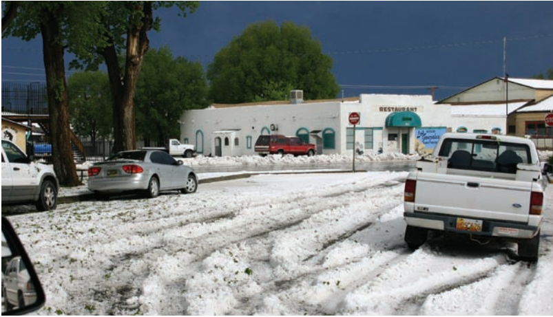
Fig. 4. Hail covering the streets of Las Vegas, New Mexico, late afternoon, May 27, 2009.

Allen Dutcher, the Nebraska State Climatologist, informed us of a massive hailstorm in the early afternoon of June 10, 2009, in farming country east of Scottsbluff in the Nebraska Panhandle. The slow-moving storm affected an area 25 miles long by five miles wide, mostly north of the North Platte River. Flash flooding occurred, and hail accumulated to a depth of six inches. Gary Aschenbrenner captured several images with his cell phone. Figure 5 shows a bleak landscape three miles north of the town of Minatare in late afternoon, about three hours after the storm ended. By this time the road had been plowed. Note the farmhouse on the distant ridge surrounded by trees completely stripped of leaves.