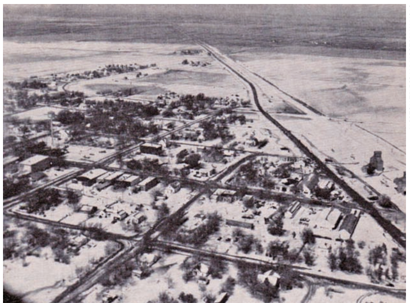
NORTON TELEGRAM, NORTON KANSAS