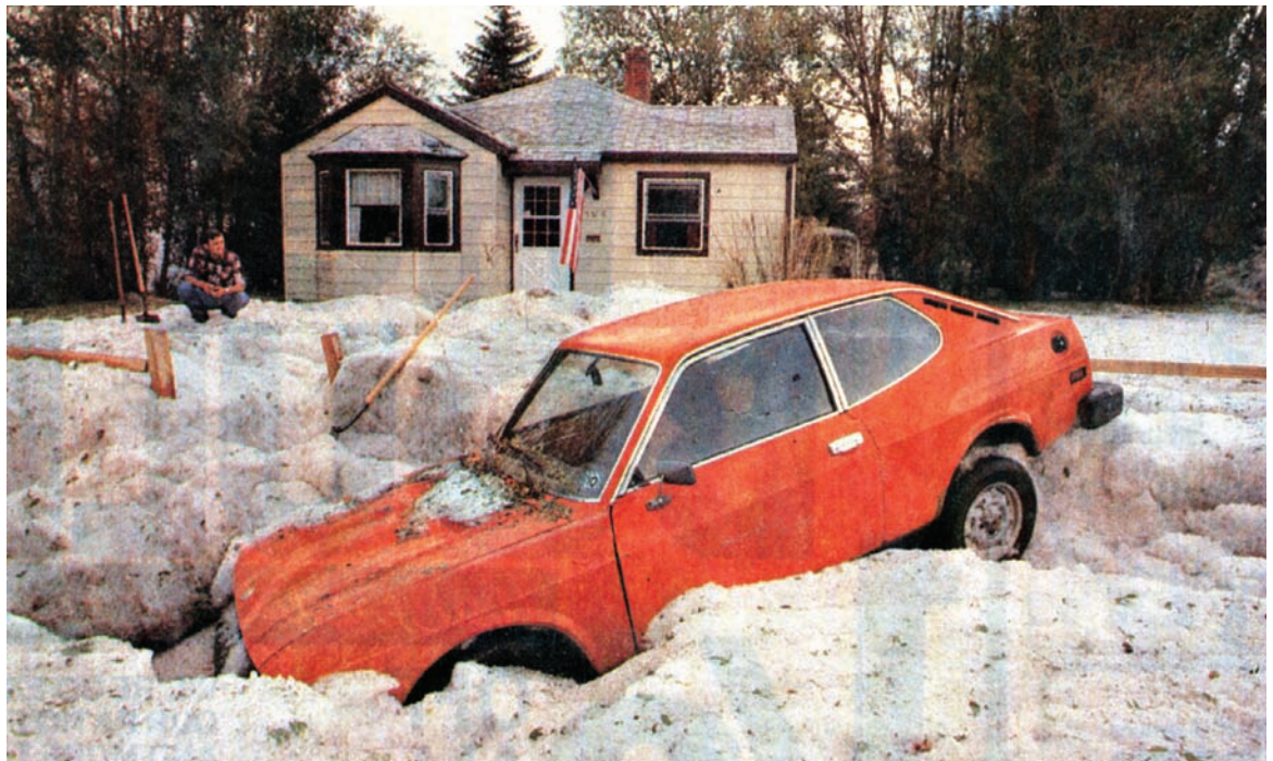
DAILY CAMERA, BOULDER, COLORADO