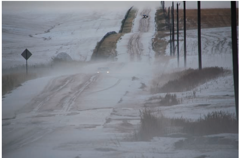
Fig. 1. Hail covers the fields and generates ground fog in Arapahoe County, Colorado, on August 17, 2009.