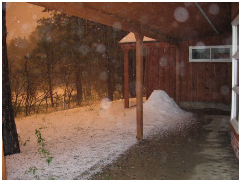
Fig. 2. At the height of a hailstorm, 7:00 p.m., May 31, 2006, near the southern border of Douglas County, Colorado. Note hail piling up below an inside corner of the roof.