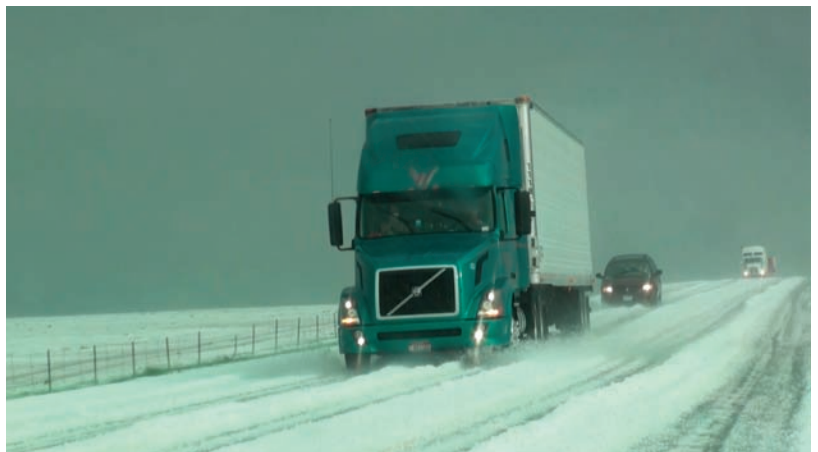
Fig. 3. Hail covering a highway in Baca County, extreme southeast Colorado, June 13, 2009.